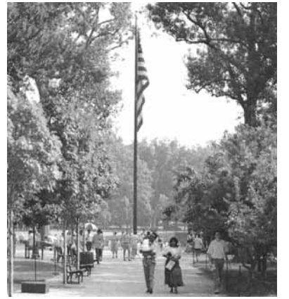
Photo: A 12 by 18 foot flag flies at the Vietnam Veterans Memorial 24 hours a day. The flagpole is located just a few feet from the statue of the "Three Servicemen" and near the walkway leading to the Memorial walls. The base of the flagpole has an inscription and the emblem of the five U.S. military services, and was designed to be placed for public viewing.

used to cover the casket and it is presented to the family as a keepsake. The local office of the Department of Veterans' Affairs can also provide information on the procedure for obtaining a flag for a deceased veteran.