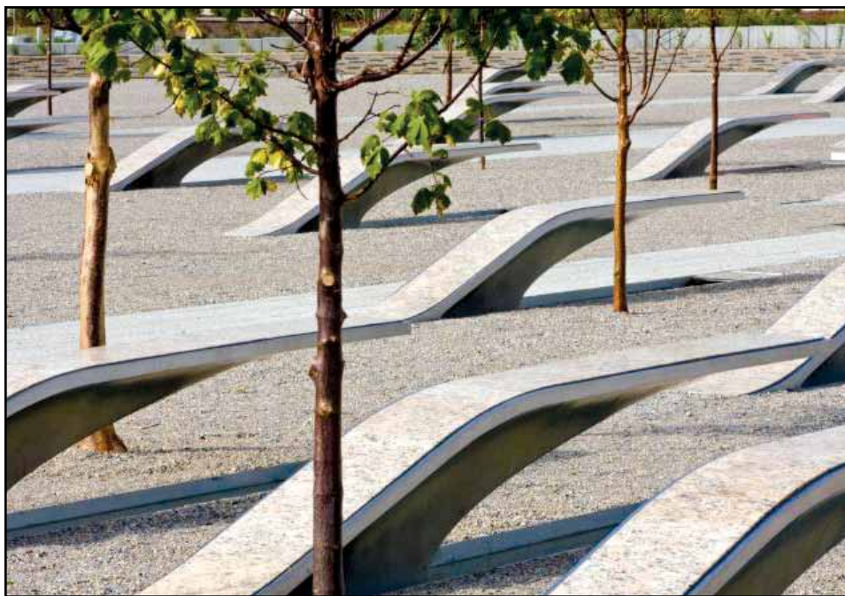
The Nation's 9/11 Pentagon Memorial. www.pentagonmemorial.org