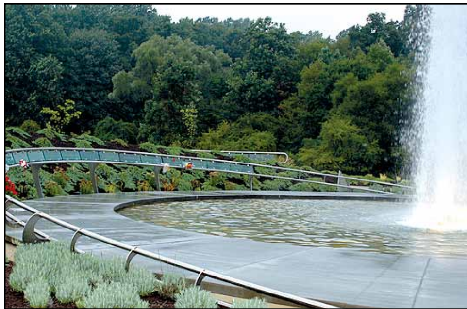
The Garden of Reflection at the Flight 93 National Memorial located in southwestern Pennsylvania. www.9-11memorialgarden.org