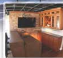
Entertainment Rooms Remodeling