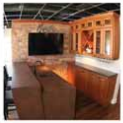
Entertainment Rooms Remodeling

Monday - Friday: 9:00am - 5:00pm • Saturday: 9:00am - 2:00pm • Sunday: Closed