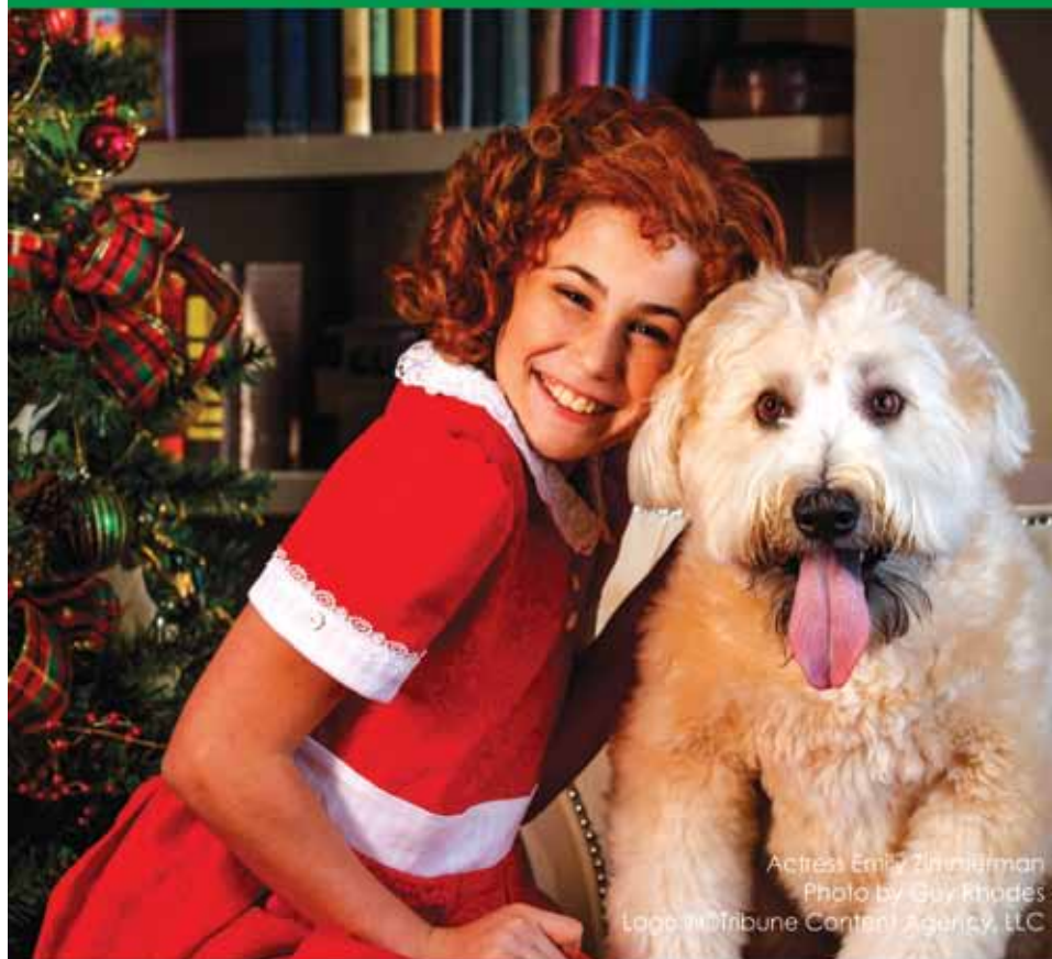
Actress Emily Zimolman Photo by Guy Rhodes Logo © Tribune Content Agency, LLC