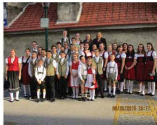
Concert in Modling, Austria 2016

Join the German-American Children's Chorus for fun, friendship, and music-making.