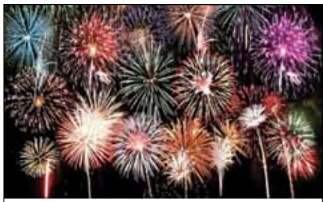
The Belmont-Central Chamber of Commerce wishes you a Happy New Year!