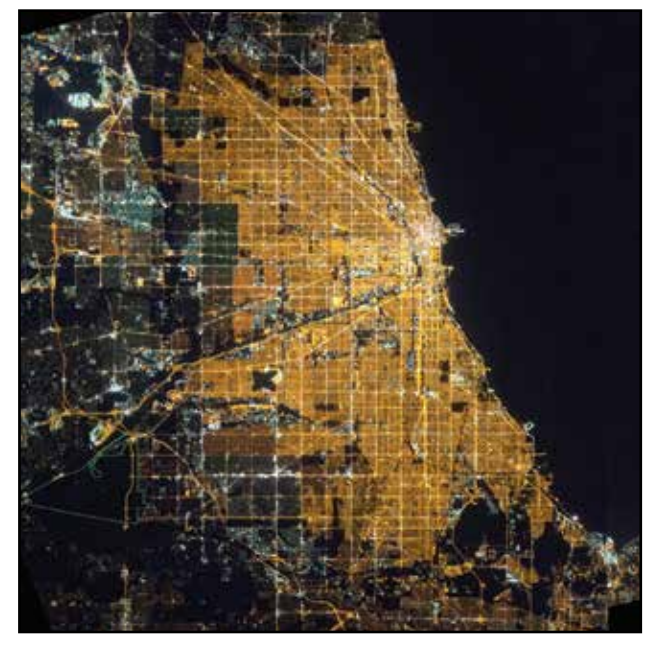
Image ISSChicagoMFI is a photo of Chicago taken from the International Space Station. The Palos Preserves Urban Night Sky Place is outlined in green. Image courtesy of the Earth Science and Remote Sensing Unit, NASA Johnson Space Center. https://eol.jsc.nasa.gov/

"For the entire history of life on Earth, dark nights followed sunlit days. In a little more than a century we've altered that