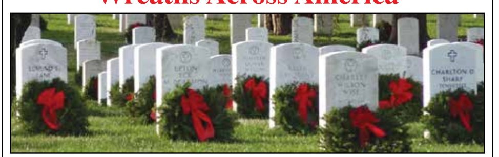
See Page 2 for Details