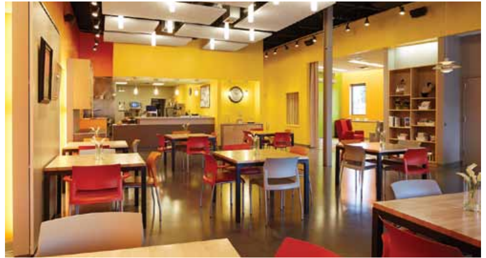
Mather's—More Than a Café in Norwood Park was recently transformed with a fresh look, more flexible multi-use spaces, a fireplace, and more.

These programs and more support the not-for-profit's mission of creating Ways to Age Well.