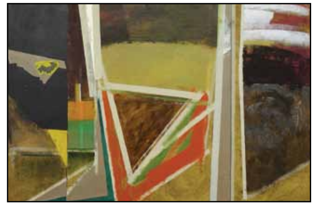
Wall 122, The Embarkation from Cythera, 1995

Olsen's work aims to surpass an automatic response in viewers by using multiple symbols in compositions that invite, even demand, close inspection and stimulate further thought by providing a context from which the underlying meaning