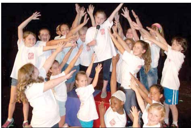
The Music Theater Works Musical Theater Summer Workshops give kids 8 to 13 the chance to sing, dance and act in a fun, nurturing atmosphere.

Register online at www.MusicTheaterWorks.com/summer or call (847) 920-5360.