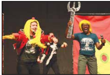
Barrel of Monkeys company members perform the student-written story "Spagety Cat."

Barrel of Monkeys, one of Chicago's leaders in arts education, will present free creative writing workshops and public performances August 5 - 10, 2019 through the new Millennium Park Theatre Series, presented by The Chicago Department of Cultural Affairs and Special Events (DCASE) as part of the 2019 Year of Chicago Theatre. Nine local theatre companies have been commissioned for one-week summer residencies and will present site-specific theatre performances that engage Millennium Park's unique architecture, design and public art.