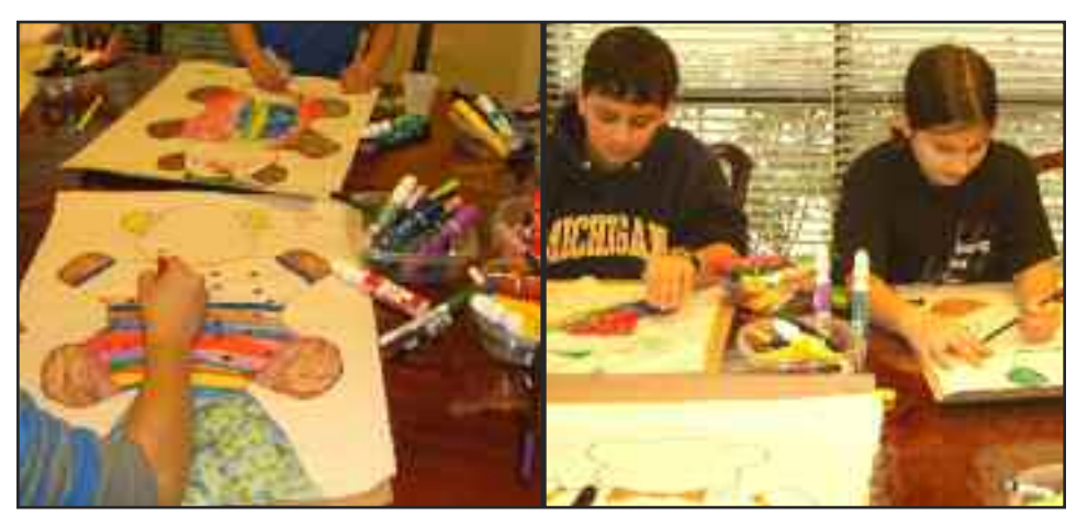
(Left) Bears being designed at Bears of Hope's Children's Craft Program. (Right) Kids working on their bear design.

North Shore Community Bank (847) 329-7049. Visit their website www.nscbank.com