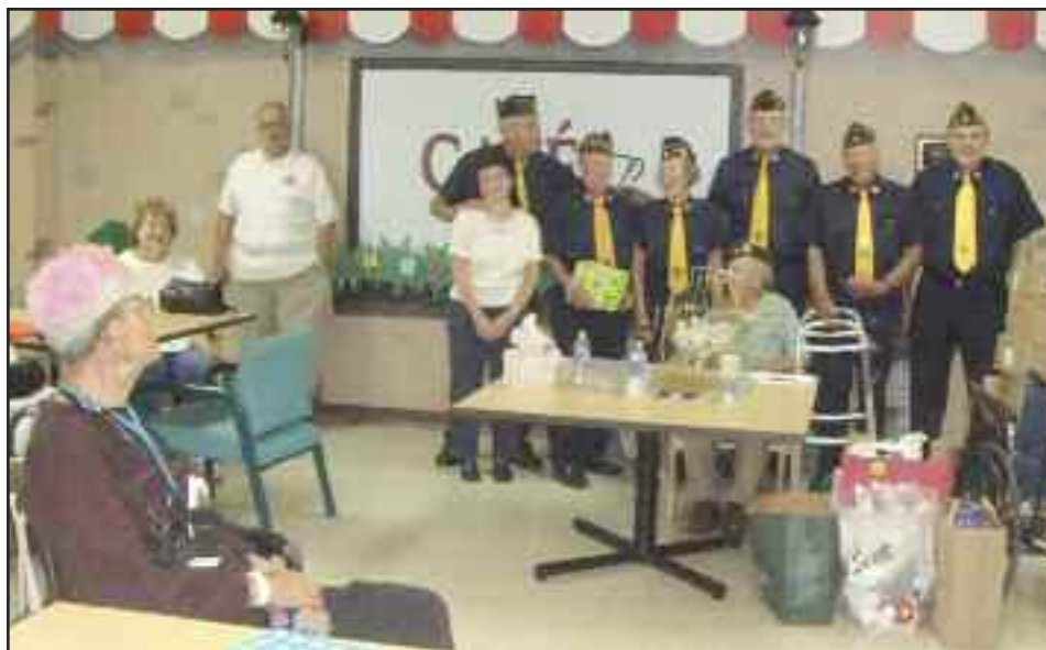
American Legion Post 541 Edison Park hosted Bingo for Veterans on September 18 at Hines Hospital.

Taxpayers also can visit cookcountytreasurer.com or call 312.443.5100 for general information in English, Polish and Spanish.