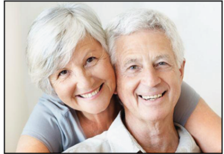
★ A Free Lecture for People Over 50 ★