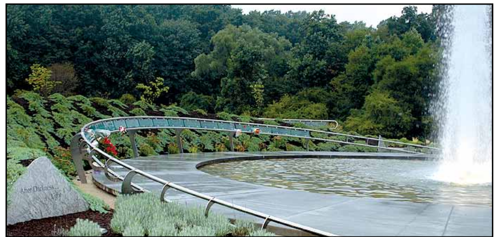
The Garden of Reflection at the Flight 93 National Memorial located in southwestern Pennsylvania. www.9-11memorialgarden.org

Pick Up Future Editions Of Our Village For Travel Tips, Courtesy Of Heritage Travel Agency