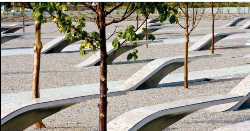
The Nation's 9/11 Pentagon Memorial. www.pentagonmemorial.org

Nightfall on the 9/11 Memorial at WTC. Honoring the lives of those who were lost is at the heart of our mission. Occupying eight of the 16 acres at the World Trade Center, the Memorial is a tribute to the past and a place of hope for the future. Go to 911memorial.org for more information.