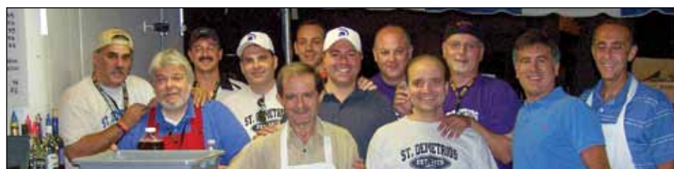
Our volunteers are ready to serve with a warm smile and maybe a joke here and there!