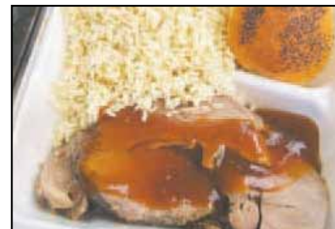
Roast Greek Leg of Lamb