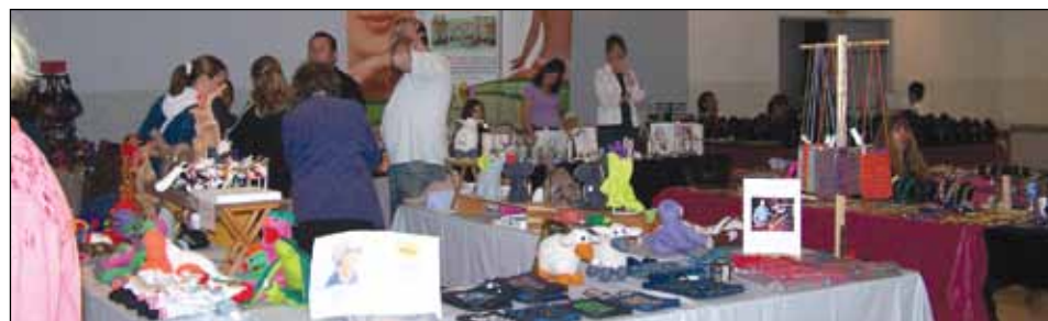
Exciting displays await and many talented entrepreneurs displaying