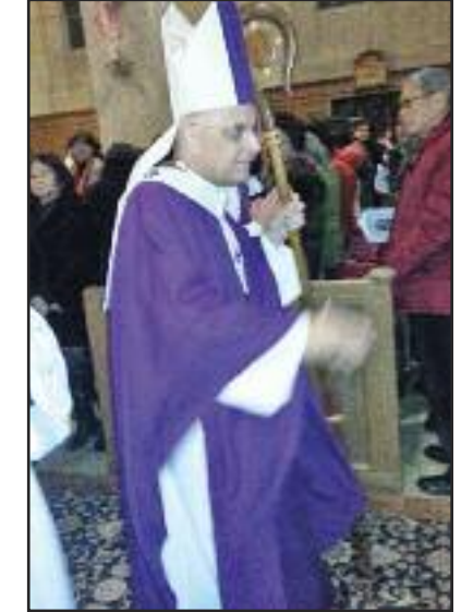
The Cardinal enters the mass

OAS Basilica had colorful symbols & decorations, including bahay kubo(bamboo hut), belen(nativity set), kalabaw(water buffalo), parol(lantern), and sabsaban(crib). After mass parishioners dined on Filipino food, then saw teenagers perform traditional dances such as "tinikling" with bamboo sticks and "sayaw sa banco" using benches. Music came from a mandolin-like instrument called a banduria.