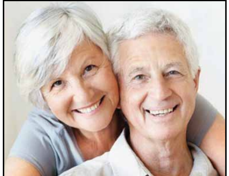
★ A Free Lecture for People Over 50 ★