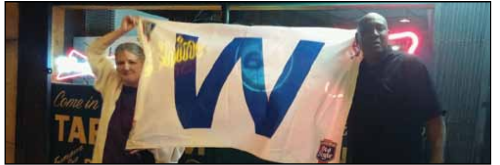
Loyal and Ever Optimistic Cubs Fans Hoist the Banner of Victory as the Chicago Land Area Celebrates with their "Cubbies".