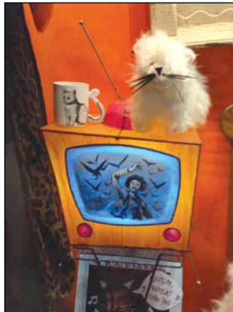
The Halloween Season Is In Full Glory With The Much Anticipated Window Display At Antique & Resale Shoppe. (See ad below and more pictures on page 5)