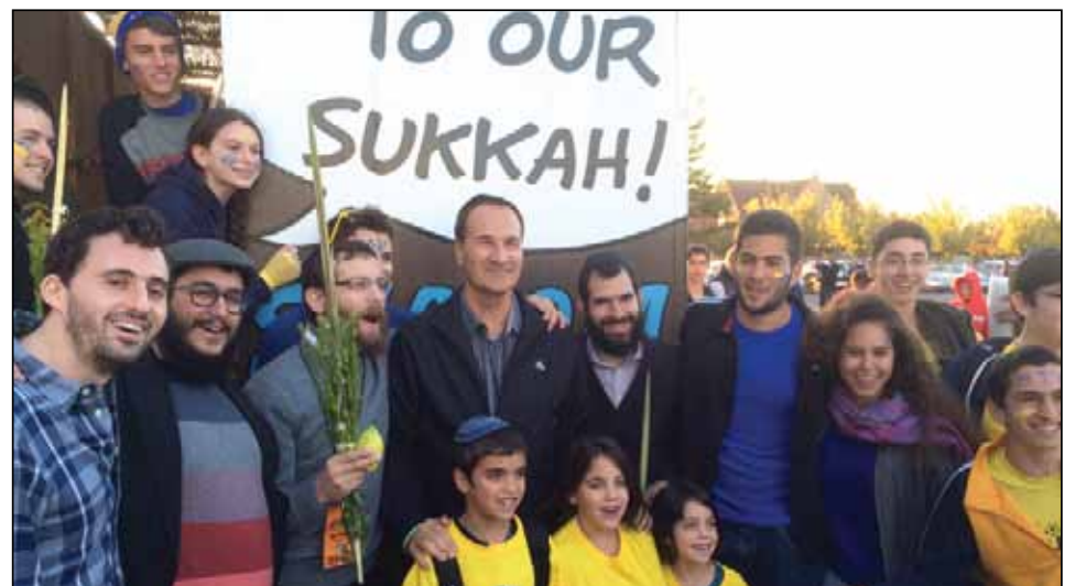
Students spend time in the sukkah before a Maccabi Tel Aviv basketball game in Chicago. In the center is former Maccabi Tel Aviv star player Tal Brody.