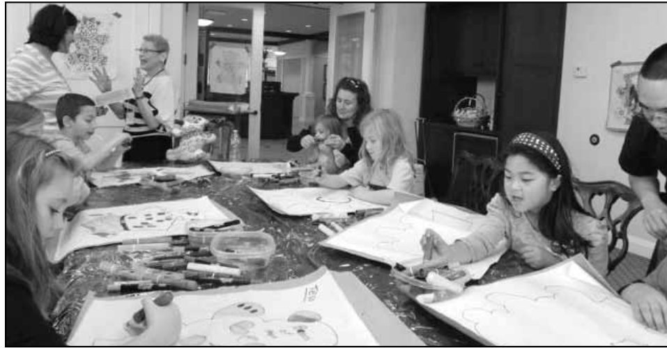
Bears of Hope bears being decorated by children.

First Bank & Trust celebrates its 20th Anniversary in September! The community and bank customers are invited to celebrate with the bank at 8047 Skokie Boulevard, Skokie, on Saturday, September 19 from 10am until noon.