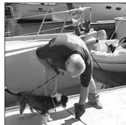
Taking care of your dog's waste will keep you off the "Worst Marina Guest" list.

It goes without saying that being considerate of others, like not hogging dock carts, keeping docks clear, or following all safety rules makes you a welcome guest. If you are a good marina mate and also a Boat Owners Association of The United States (BoatUS) member, give yourself a break by taking advantage of the savings offered on marina fuel, transient slip or repair discounts at www.BoatUS.com/map . To join, go to BoatUS.com/membership .