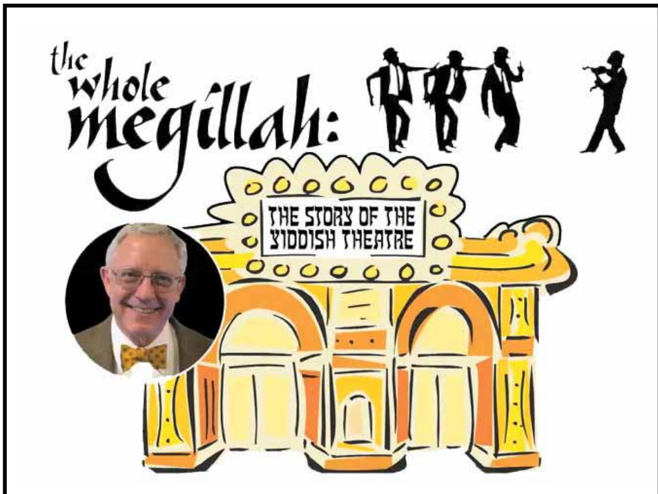
Live theatre requires more collaboration between artists than any other form of art. This is why there is nothing more exciting than live entertainment. And when our favorite artists collaborate in new ways, the results are spectacular.

musicals were created. He delights audiences with a different presentation on the first Wednesday of every month.