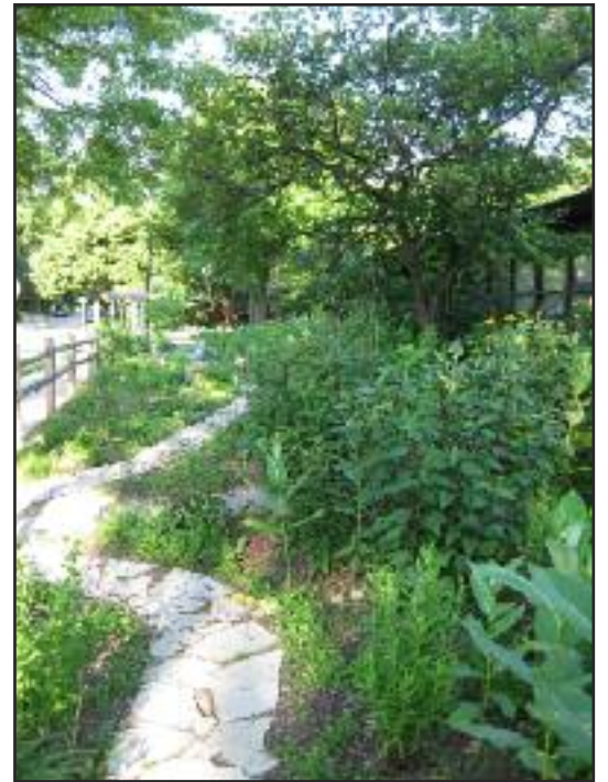
Washington Elementary School's Monarch Butterfly Garden

For more information, go to KEB's web site, or phone the KEB office at 847-448-8256 x105. Proceeds of the event help fund civic projects and environmental education in Evanston and Evanston/Skokie schools.