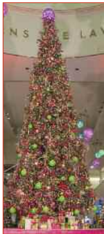
Grand Tree - The Museum's 45-foot Grand Tree is decorated with more than 30,000 lights and more than 1,000 ornaments.

(See page 9 for the Austrian Mixed Chorus performance time and date.)