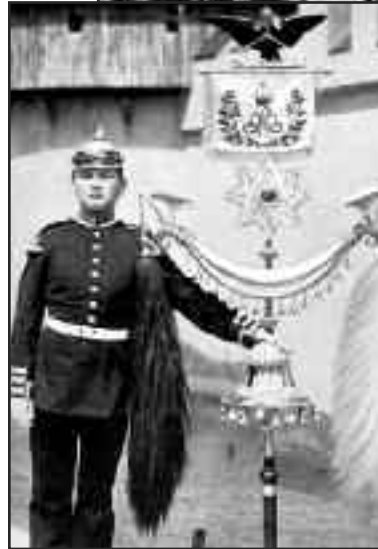
(left) Schellenbaumtrager - parade percussion instrument used in the Franco Prussian War displayed at the Deutsches Haus - World Columbian Exposition, passed to the German World War I veterans, entrusted to DANK