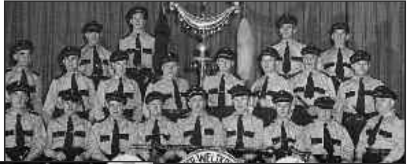
(above) World War Veterans - Pictured are club members of the Verein Deutscher Weltkriegs Veteranen des Chicago, a fraternal men's veterans organization. They are posed with their silver standard, first brought to Chicago for the World's Columbian Exposition in 1893.

The exhibition opens on Friday, October 2 and runs through October 2011. The public is invited to Opening Night, Friday October 2, 2009 at 7:30 pm, group entry every 30 minutes until 11:30 pm. Free and open to the public.